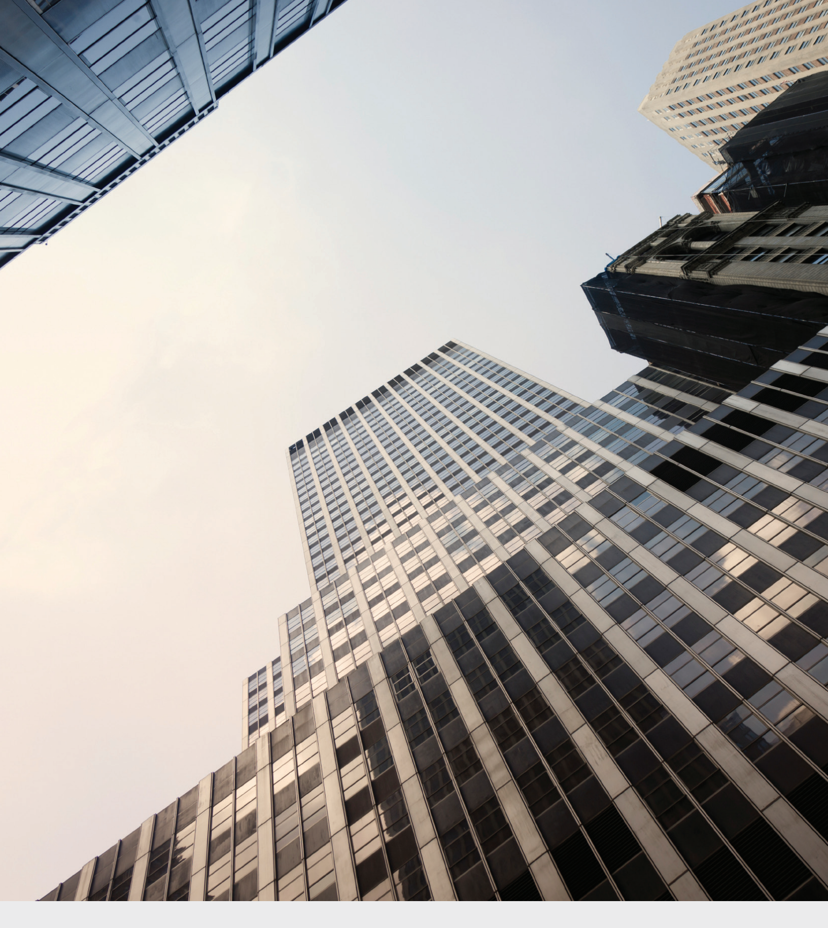
Copyright © 2012 Perr&Knight. All Rights Reserved.

Perr&Knight is not a law firm and does not provide legal advice, services and/or opinions. Perr&Knight, and its employees, cannot act as legal counsel with respect to any matter and no attorney-client relationship is implied or created by anything contained herein. To the extent that, during the course of providing consulting and other services, any information regarding legal matters is provided, Perr&Knight has made commercially reasonable efforts to ensure that such information is accurate. However, as laws vary from jurisdiction to jurisdiction and change rapidly, such information may not be up to date and all legal matters should be reviewed by your own in-house counsel, outside counsel and/or other legal advisors, as appropriate, who are licensed or otherwise permitted to practice law in the jurisdiction(s) involved.